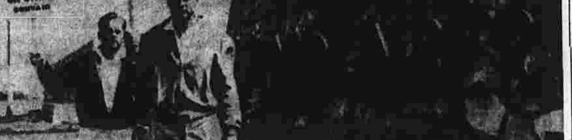
Dick Nixon, escorted by police, is seen in a photograph taken during his flight from New York to Los Angeles.

Washington, June 7 (AP)—Two Atlas ICBM test launchings from Cape Canaveral scheduled for this week have been canceled because of a strike by machinists, the Air Force said today.